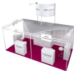
Visuel stand 18 m 2 - 3 faces (Lille, Lyon)